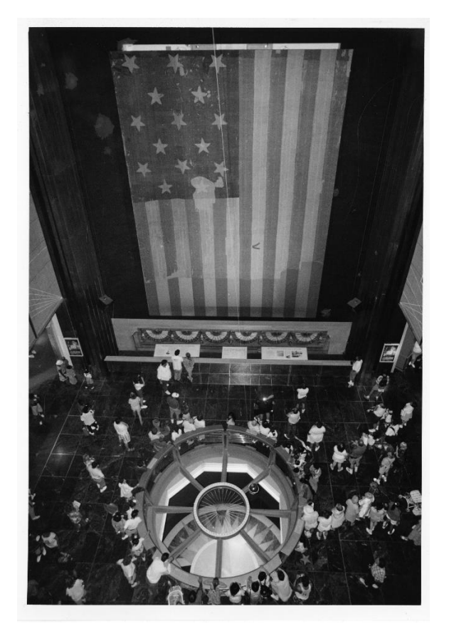
Fig. 4 Foucault pendulum in front of the Star-Spangled Banner in the Smithsonian's Museum of History and Technology.

modern as the building might appear from the outside, visitors to the museum could hardly tell whether they were in a museum of technology from the beginning of the century or in postwar America. Were it not for a few contemporary objects, such as a satellite or a fusion reactor, they would probably not have noticed much difference.