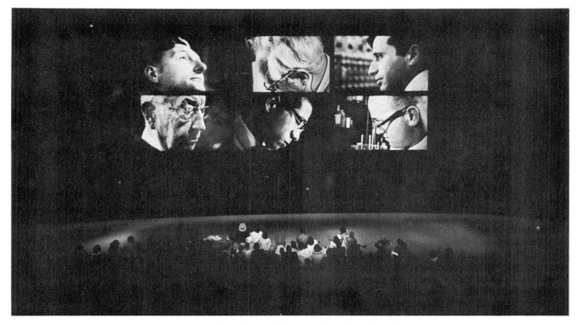
"These are the men that inhabit the House."

The Eameses were incredibly successful at international and World's Fairs. For example, the 1962 World's Fair in Seattle featured a huge U.S. Science Exhibit – almost the size of a major science museum. A multiscreen projection The House of Science stood at the beginning of a visit which employed no less than six huge screens that were used to show not one object, building or person but six versions thereof at the same time. The method had been used at an American exhibition in Moscow three years before, presenting the American life to an audience beyond the iron curtain. A gist, the idea, or a generalisation of the American life was communicated by showing not one but, at this instance, seven freeway junctions or seven suburban houses with swimming pools. Similarly, in Seattle, the simultaneous projection of six observatories, six scientists in the lab (Fig. 7), or six atomic models conveyed the general idea of an observatory, the scientific persona, or the atomic structure in general. Later at the 1964 World's fair in New York the Eameses created an even more elaborate three-dimensional projection environment to communicate the essence of the computer as a universal machine, an exhibit commissioned by IBM. How this all worked has been documented on film [14].