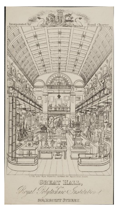
Fig. 2. Great Hall of the Royal Polytechnic Institution, London, c. 1840, printed by CJ Cox, n.d.

A very different way of bringing science to the public emerged as a fashionable, if not competitive, enterprise in London in the first half of the 19th century. The Colosseum in Regent's Park, the Adelaide Gallery near Piccadilly Circus, the Polytechnic Institution in Regent's St and the like were private enterprises that sought to make money by exhibiting scientific instruments and gadgets to a shilling crowd.