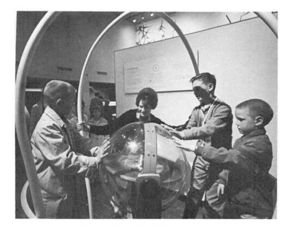
The Gyroscope Exhibit (No. 12)—One of the most popular exhibits.