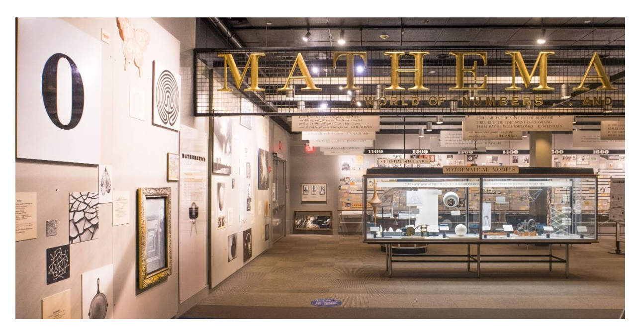
Fig. 5 MATHEMATICA exhibit with image wall, history wall and objects. Photo of the Boston exhibit in 2021.

Before I discuss to the new objects of science communication in more detail, I should introduce some key concepts of the Eameses for idea communication. On the basis of vast research into a topic, e.g. mathematics, the Eameses created history walls and image walls. Like a hypertext structure, many information items are multidimensionally arranged and linked. There is no one linear reading of the information anymore, and every visitor has to decide how to navigate the information, or rather, how to select some bits and pieces because it was simply too much to digest. The visitor is made to select from the plenty and is shown the whole lot at the same time; in this way a sense of the richness and the whole of the subject is conveyed.