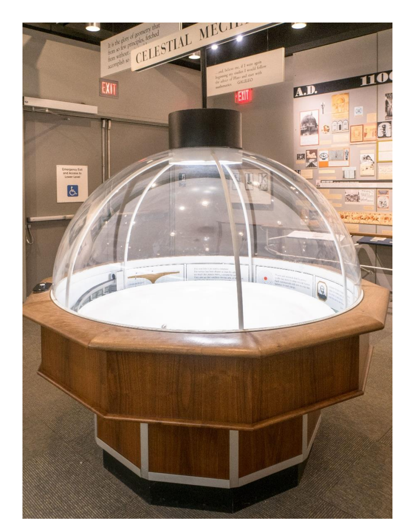
Fig. 6 MATHEMATICA Pin-ball machine to demonstrate celestial mechanics. Photo of the Boston exhibit in 2021.

For example, celestial mechanics and thus Kepler's laws, were demonstrated using a kind of pin-ball machine. While watching the ball's orbit, an explanatory text comes into view on the edge of the device. The positioning of the exhibit in the middle of the floor creates a communicative situation in which visitors can observe the phenomenon from all sides of the machine and, at the same time, view the reactions of fellow museum-goers. Similarly, the 'Probability Machine' can be observed from two sides. This is a push-button exhibit that allows visitors to follow how the Gaussian distribution emerges from a process of averaging. Other interactives include the Moebius strip, the one-sidedness of which is demonstrated by an arrow that, when activated, travels along the surface of the strip. And yet another push-button exhibit makes minimal surfaces visible by dipping a wire body in soapy water.